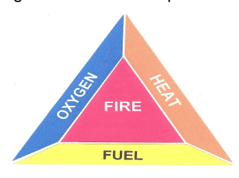
The Fire Triangle

Three components are necessary for fire: fuel, oxygen, and a source of ignition. Although you need to eliminate only one of these three components to extinguish a fire, FLAME SAFE products produce outstanding results by eliminating two of these components.